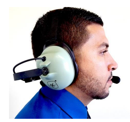
Figure 2: Positioning the Microphone